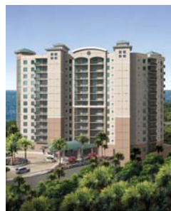
Sannibel Passage Fort Myers, FL

MLG creates carefully designed communities that offer a unique blend of serene, beautiful settings with luxurious residences. Our attention to detail as well as