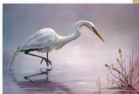
“Soft Fog Walker”