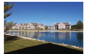
Northhaven Door County, WI

commercial projects. MLG is a multi-faceted real-estate consortium with operations in Wisconsin, Florida, Virginia and Texas, and a portfolio that includes office buildings, multi-family complexes, retail and industrial properties and mixed-use land developments.